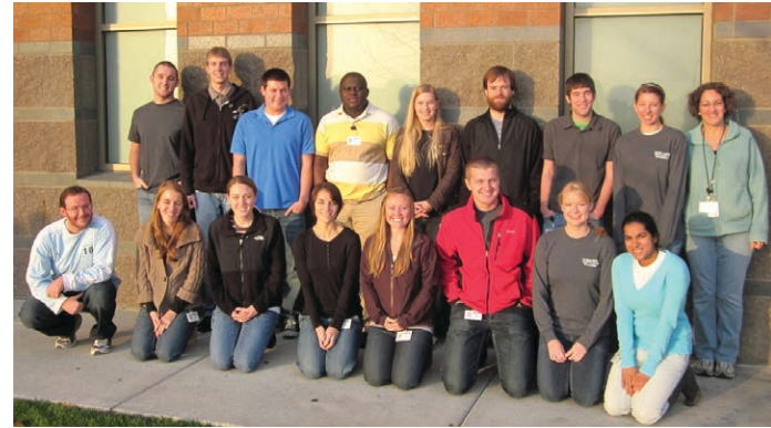
Students at the jail on Saturday morning before entering to engage with inmates