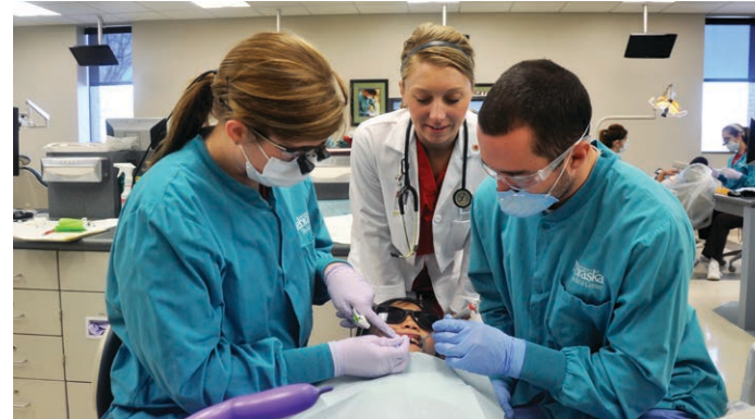
UNMC COD-Dental and Dental Hygiene students and a UNMC CON-Lincoln Nursing student collaborate at the chairside during Dental Day

and are triaged before being seen by students and supervising faculty of the respective college. The treatment process often includes X-rays and procedures to relieve pain or treat infection. The primary procedures performed include cleaning, extraction, restoration, and occasionally a subsequent referral for root canal therapy. Procedures are performed at the SHARING Clinic at no cost to the patient. The college developed this program to enhance interprofessional education opportunities with students from the Lincoln Division of the College of Nursing and health professions students from Omaha.