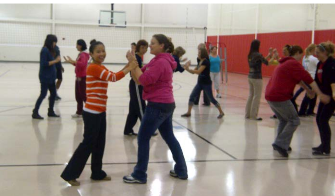
Students at EMPOWER organized a Krav Maga (self-defense) workshop at the student life center