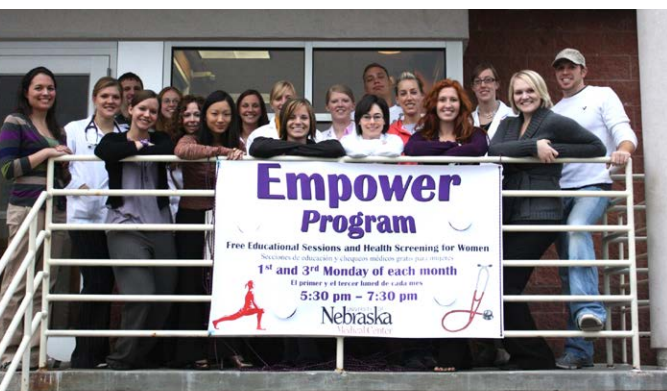
Students serving victims of domestic violence at the WCA