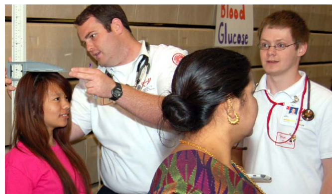
Medical, nursing and PA students giving flu shots and conducting basic screening at health education and clinical sessions