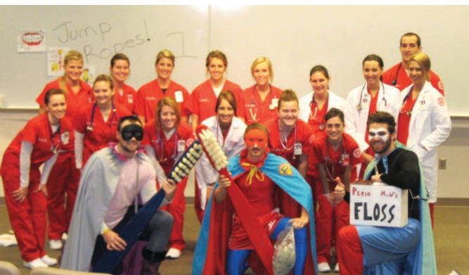
UNMC COD and UNMC CON-Lincoln students participated in the February 3, 2012 Children's Dental Day

CON work collaboratively to help deliver the needed care and in doing so they gain experience with, and appreciation for, team-based practice.