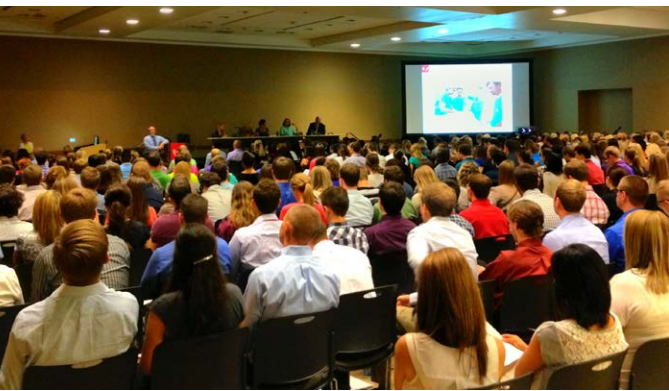
Students participating in a panel discussion with campus clinicians and hospital leadership

group members in which they explore backgrounds, educational histories, and personal and professional goals. Following the interviews, the list of assumptions is re-examined in light of what the group members have learned about each other, and students are asked to consider whether they still feel the assumptions are valid. Next, the students develop a code of ethics by identifying key concepts describing professional behavior, expanding the concepts into statements, and building the statements into a code. They are then asked to review several cases that include ethical dilemmas, and to attempt to apply their code to the situations described. After completing any necessary revisions to their code suggested by the cases, they submit their completed version which is shared with the other participating groups.