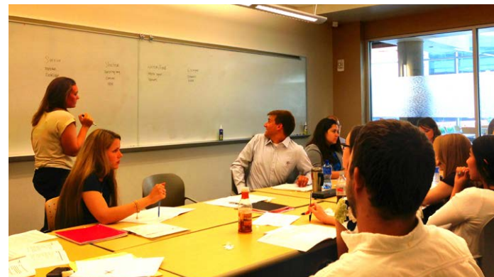
An IPE Day small group in action