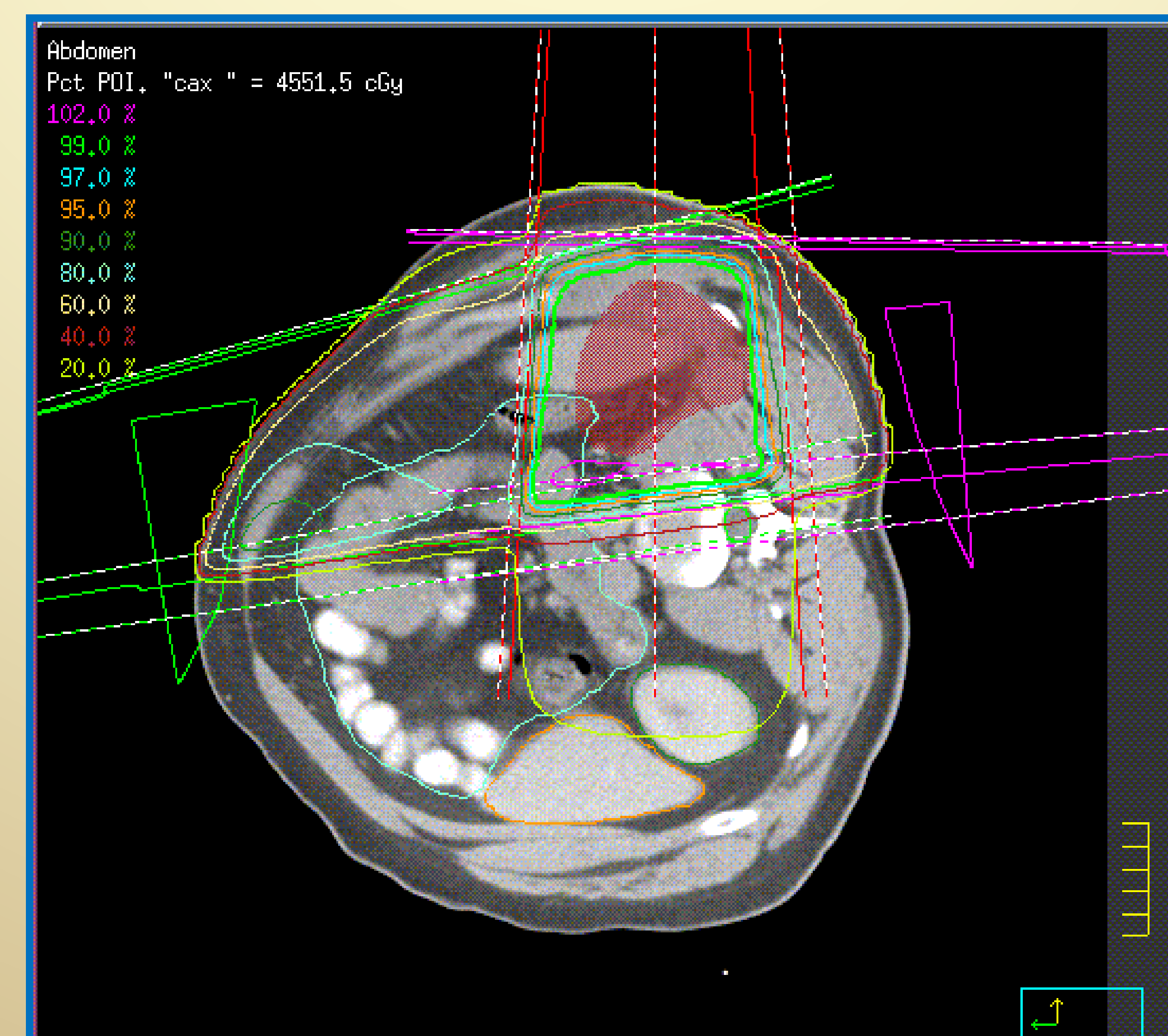
Figure 2. Lt. Lat. Decubitus computer plan.

According to the Decubitus plan, the volume of small bowel included in the field was much less than the supine and the dose was limited to approximately 80% or 4320cGy.