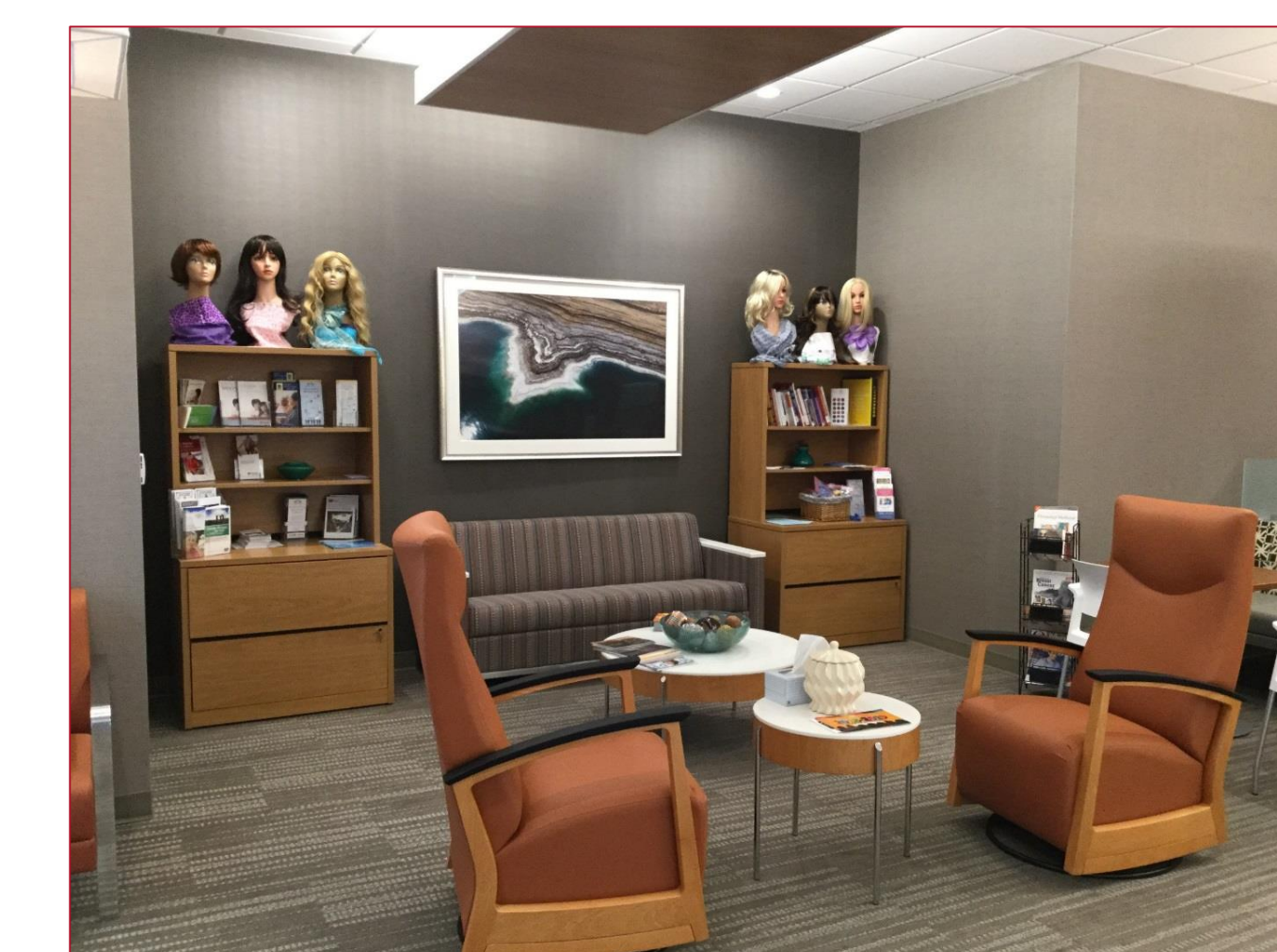
Left: Front entrance