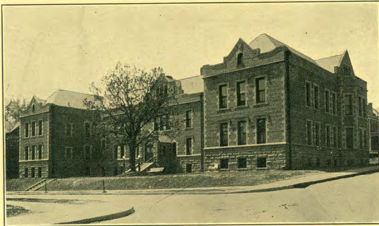
WISE MEMORIAL HOSPITAL Harney Street and Twenty-fourth Avenue