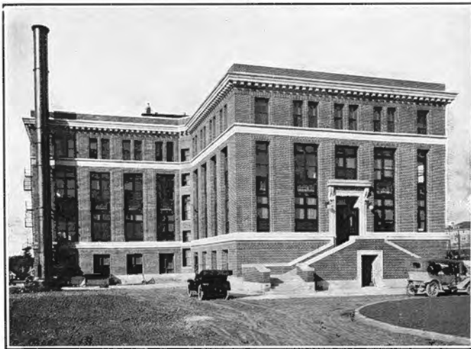
UNIVERSITY OF NEBRASKA COLLEGE OF MEDICINE