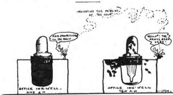
A STORY WITHOUT MORALS

Age fosters dignity. This was shown in Pathology quiz the other day. One of the instructors came into the room, doffed his coat and hat, glanced at the assembled sophomores and proceeded to call the roll of his SENIOR class.