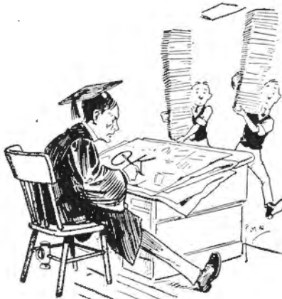
Senior Pathologist O. K. s the Appendices

Pierre, S. D., Jan. 29.—South Dakotans will be protected from unscrupulous practitioners who diagnose any illness as appendicitis and then perform an operation, under a bill prepared for introduction in the state legislature. This bill would require that all appendices, removed in operations, be sent to the state laboratory for examination. These appendices after being examined would then be returned to their respective "owners," together with a certificate showing their condition. In the event an appendix was not diseased the "owner"