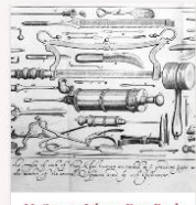
McGoogan Library Rare Book Collection