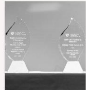
Honors & Awards