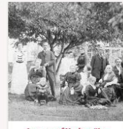
Legacies of Healing: The Wigton/Swift Family