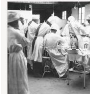
Nebraska and World War I