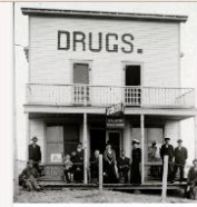
Early Rural Practitioners