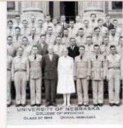
Education & WWII