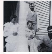
Native Healers Susan La Flesche Picotte, MD