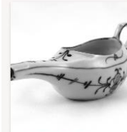
Infant Feeder Collection