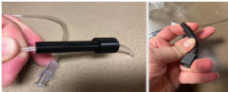
Figure 1. IV tubing adapter attached to arterial line tubing.

line tubing to replace specialized IV tubing. This 3D printed adapter help solve an acute hospital supply chain shortage.