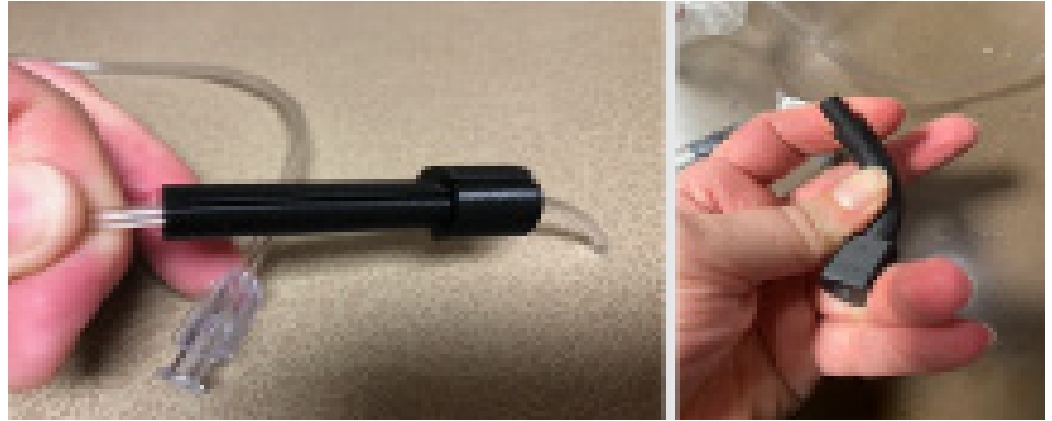
Figure 1. IV tubing adapter attached to arterial line tubing.

line tubing to replace specialized IV tubing. This 3D printed adapter help solve an acute hospital supply chain shortage.