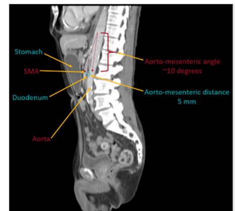
Figure 1. Features suggestive of superior mesenteric artery (SMA) syndrome including evidence of gastric and duodenal obstruction, aortomesenteric angle of \leq 25^\circ , and aortomesenteric distance of < 8-10 mm as shown above.

Conclusion: The diagnosis of SMA syndrome relies on clinical symptoms and supporting radiologic findings, with the most sensitive finding being an aortomesenteric angle \leq 25^\circ , which was present in this case. It was difficult to ascribe the indolent symptoms in the months prior as causing his weight loss or if the weight loss was a result of early