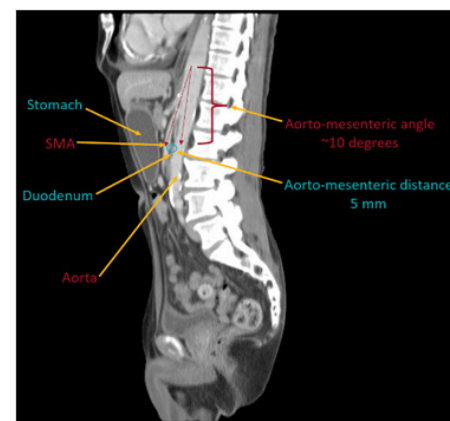
Figure 1. Features suggestive of superior mesenteric artery (SMA) syndrome including evidence of gastric and duodenal obstruction, aortomesenteric angle of \leq 25^\circ , and aortomesenteric distance of < 8-10 mm as shown above.

Conclusion: The diagnosis of SMA syndrome relies on clinical symptoms and supporting radiologic findings, with the most sensitive finding being an aortomesenteric angle \leq 25^\circ , which was present in this case. It was difficult to ascribe the indolent symptoms in the months prior as causing his weight loss or if the weight loss was a result of early