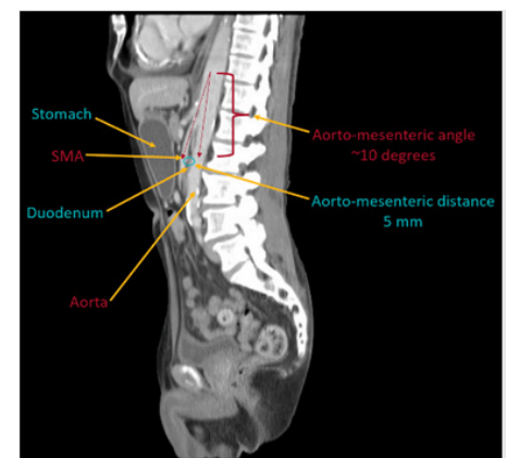
Figure 1. Features suggestive of superior mesenteric artery (SMA) syndrome including evidence of gastric and duodenal obstruction, aortomesenteric angle of \leq 25^\circ , and aortomesenteric distance of < 8-10 mm as shown above.

Conclusion: The diagnosis of SMA syndrome relies on clinical symptoms and supporting radiologic findings, with the most sensitive finding being an aortomesenteric angle \leq 25^\circ , which was present in this case. It was difficult to ascribe the indolent symptoms in the months prior as causing his weight loss or if the weight loss was a result of early