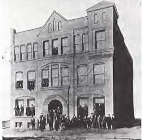
Omaha Medical College students pose for a photograph with their new brick and stone building, ca. 1893.